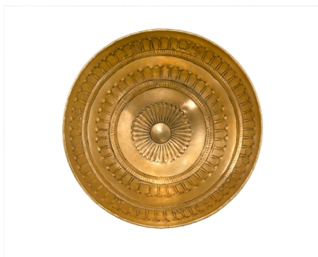
Image: Gold bowl c. 700, Cypriot.

Enhances museum services to sustain heritage, culture, and knowledge among federally recognized tribes and organizations that primarily serve and represent Native Hawaiians.