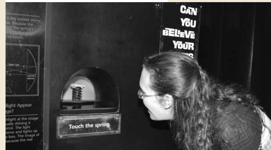
A Center for Informal Learning and Schools practitioner investigates science exhibits at the Exploratorium.

Speak out, share practices, build relationships in the educational community, support increased research and evaluation, and encourage training and development.