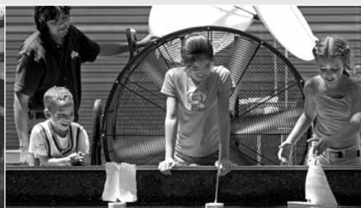
Students race sailboats in Waterworks at the Big Lab. (California Science Center School)