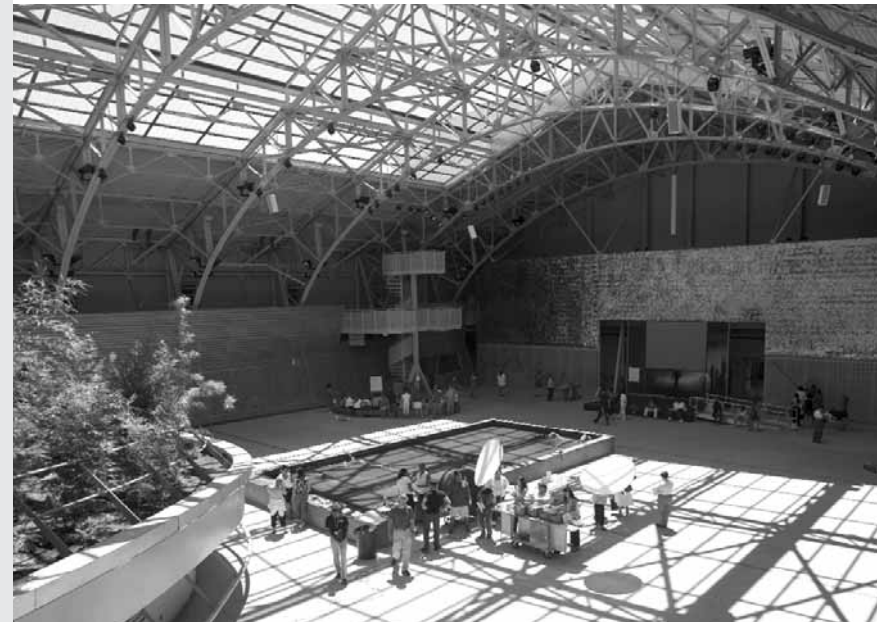
The Big Lab at the California Science Center School is a giant space where students can conduct a variety of experiments in physics, ecology and flotation.