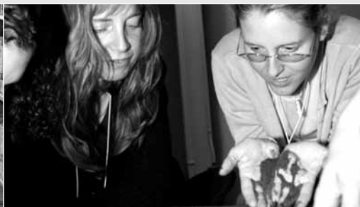
CILS researchers and practitioners investigate science exhibits at the Exploratorium.