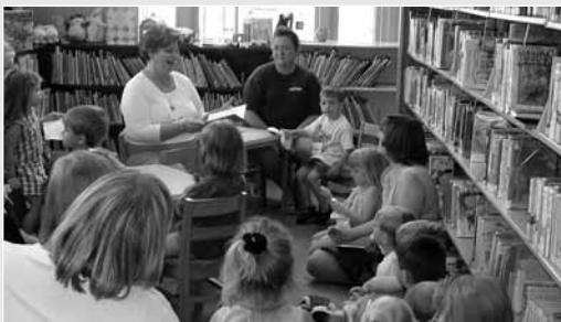
Fulton County Summer Reading Program (Kentucky Department for Libraries and Archives School and Public Library Partnership Programs)

Discipline-based partnerships enable museums and libraries to use their expertise to help strengthen K-12 teaching in specific content areas. Although the examples below focus on science, museums and libraries representing other disciplines, such as history and art, are involved in similar collaborations. In many disciplines, museums and libraries have developed programs that help students meet state and national reading and writing standards. In the arts, for example, research has shown that studying the arts helps to improvement achievement in other subjects, including reading, writing, and mathematics. In places like science