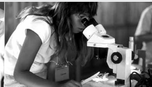
Exploring science through Primero La Ciencia at the Chicago Botanic Garden