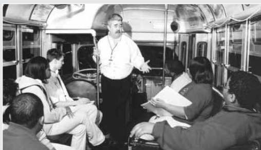
Students visit the bus on which Rosa Parks refused to give up her seat, inciting the Montgomery Bus Boycott of 1955-56.

In recent years, school districts across the country, including New York City, Boston, Chicago, and Seattle, have begun experimenting with restructuring large high schools into multiplexes of smaller schools under the same roof. According to early research, small schools have lower dropout rates, greater academic achievement, and higher levels of satisfaction among students, teachers, and parents. But how do small schools’ needs for library and information services differ from their larger counterparts? And how should existing resources for library and information services be realigned to meet the needs of small schools? These are the kinds of questions that will be addressed over the course of a three-year collaborative between the