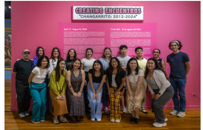
Mexic-Arte Internship and Fellowship Program