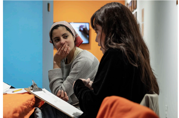
Rubin Center for the Visual Arts Internship and Fellowship Program